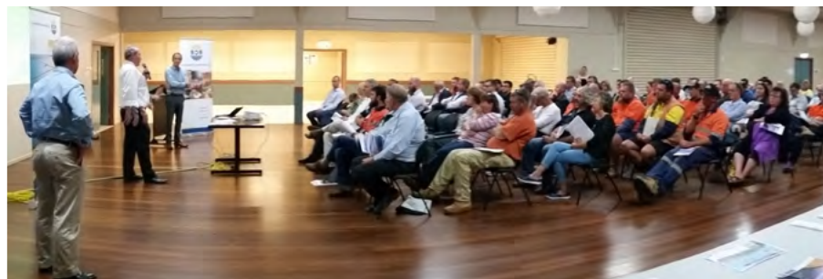
Community engagement sessions received a positive response.

Local communities members are encouraged to send through any questions or expressions of interest. Contact details are at the top right of this page.