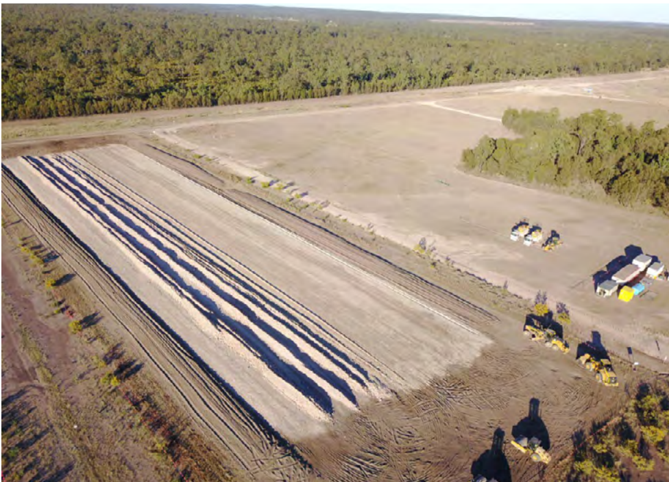
Civil works stage 1 - preparing hard stand site for cable storage

Approved in December 2015, the Darling Downs Solar Farm is one of eight solar projects Western Downs Regional Council has approved to date, and further cements our position as a progressive region at the forefront of the renewable energy movement.