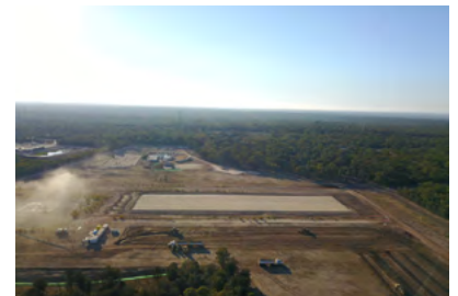
DDSF site civil works