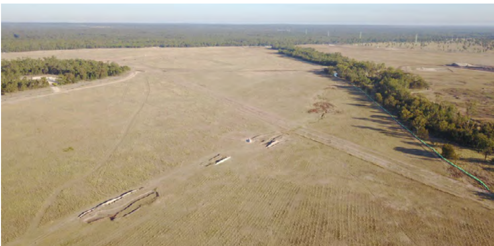
Future solar panel site