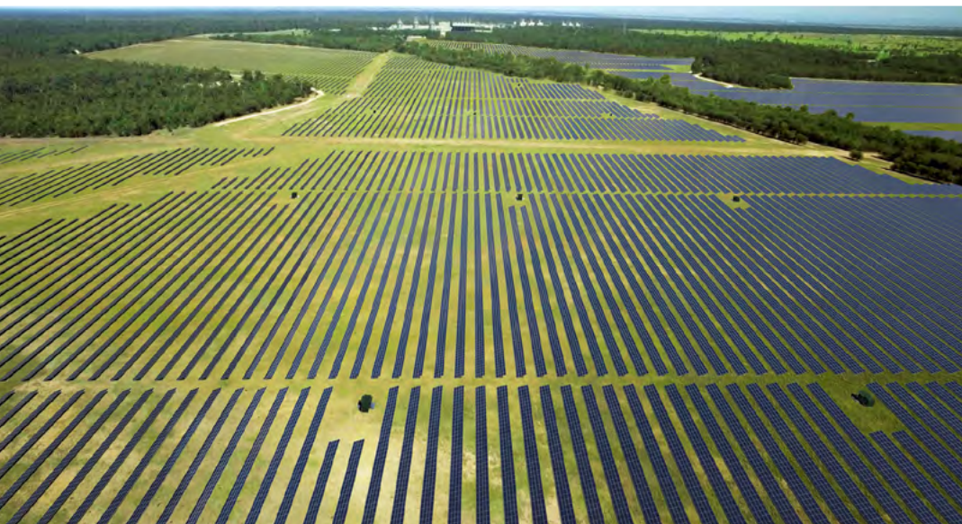
artist's impression of the solar farm.