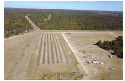
DDSF stage 1 civil works