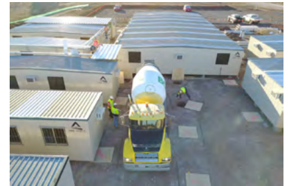
DDSF site offices for RCR Infrastructure