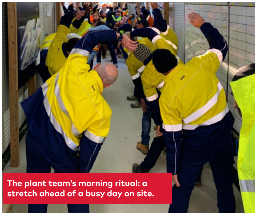
The plant team's morning ritual: a stretch ahead of a busy day on site.

Orbost Home Hardware and Timber – 87-89 Nicholson St, Orbost