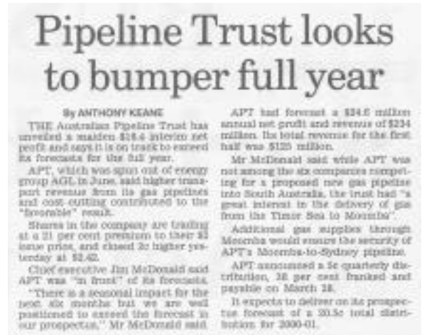
The Adelaide Advertiser 3/3/2001

The remaining 15% interest in the Roma to Brisbane pipeline was purchased from our joint venture partner, Interstate RBP Pipelines Pty Limited, in February 2001.