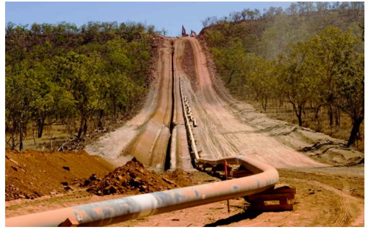
STRINGING THE BONAPARTE PIPELINE 2006