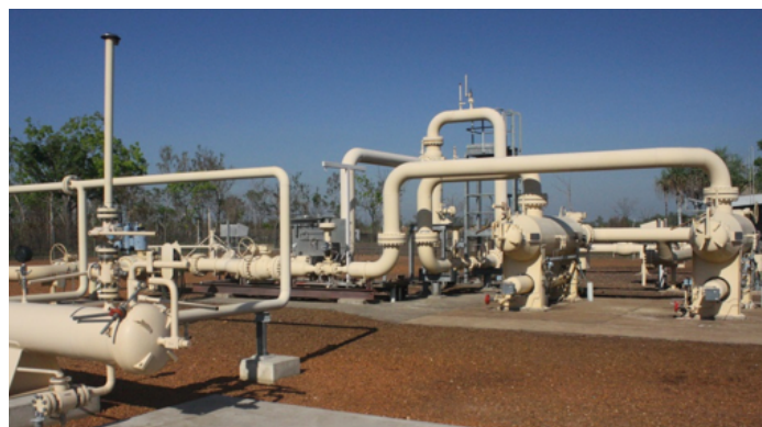
DARWIN CITY GATE

In 2009, APA built the 282 kilometre Bonaparte Gas Pipeline to transport gas from the Blacktip offshore gas field, from Wadeye to Ban Ban Springs, where it interconnects with the Amadeus Gas Pipeline.