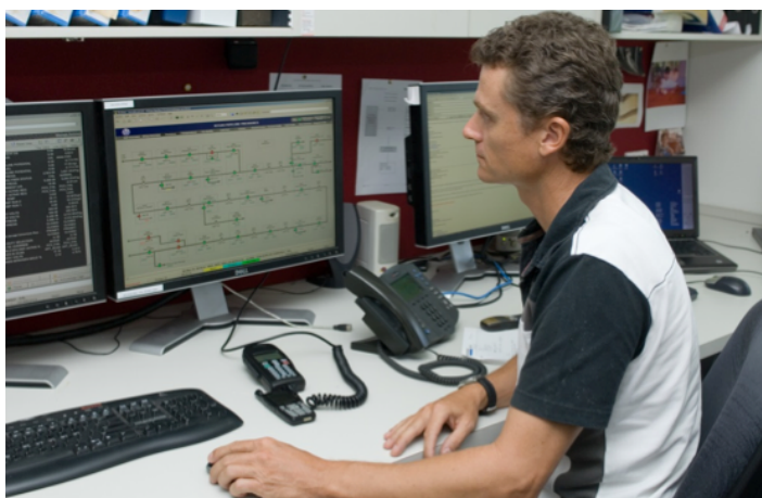
DARWIN CONTROL ROOM

Main office - Palmerston Northern Territory employees - 50