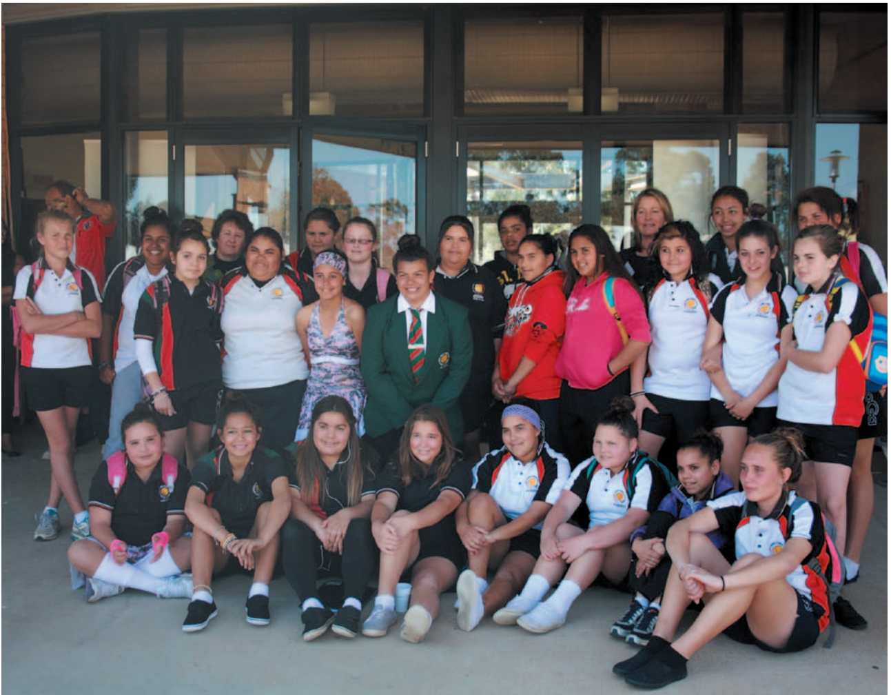
AGC participants in a National Child Protection Week event in Dubbo, 6 September 2011.