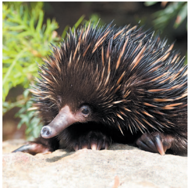
Short Beaked Echidna at Taronga Zoo.

There are many ways in which we can reduce our environmental footprint, not just in the things we build, but also in the products we buy and the things we do every day. At APA, we believe even a small change can make a big difference and encourages all employees to minimise waste, recycle material and save costs.