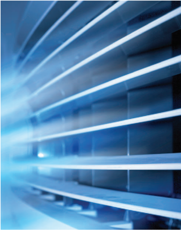
Reliable and environmentally efficient gas-fired air conditioning.