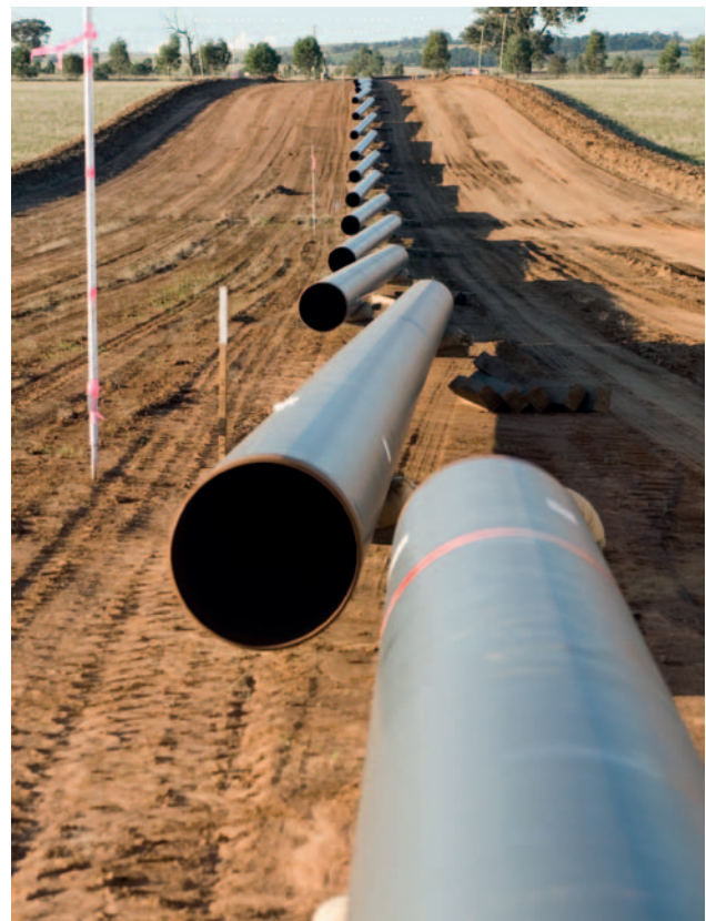
Capacity expansion on the Moomba to Sydney pipeline, Young looping, NSW.