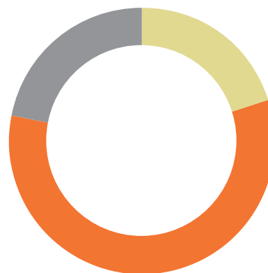
APA EMPLOYEES BY AGE