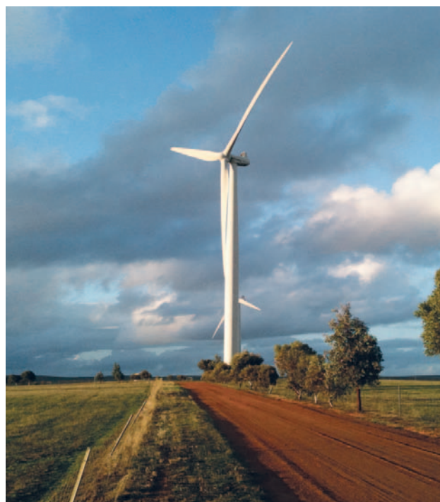
Emu Downs wind farm.