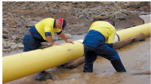
The exposed Rocky Creek RBP 16" transmission line at the base of the Toowoomba Range is normally buried more than under 1.2 metres underground.

Total community investment and sponsorship for the 2011 financial year was $263,170.