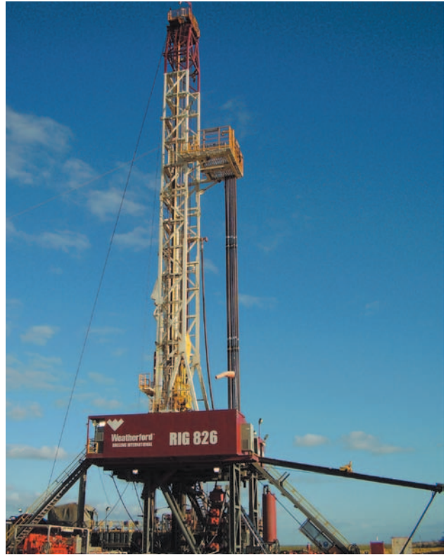
Drilling rig at the Mondarra Gas Storage Facility.